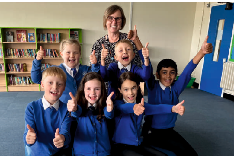
Kinsale celebrates Ofsted report - page 10