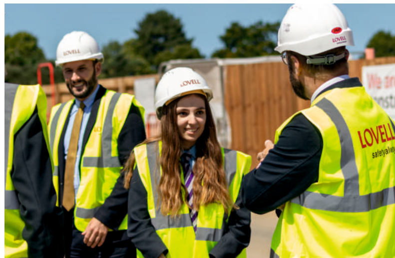
Award for construction partnership - page 9