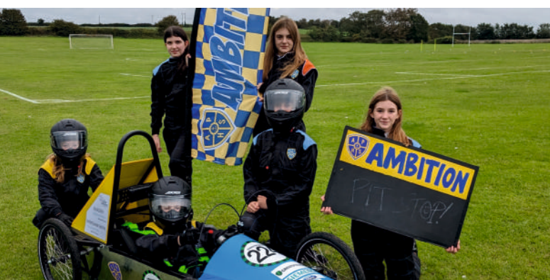
Celebrating STEM success at APHS - pages 2&3