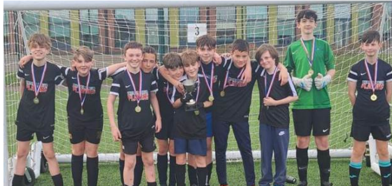
Acle Academy's Year 7 boys won the final of the community cup.