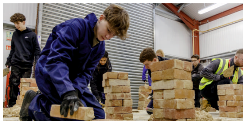
Building skills for the future - pages 8&9