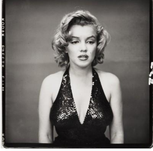
The Last Sitting Bert Stern (1962)